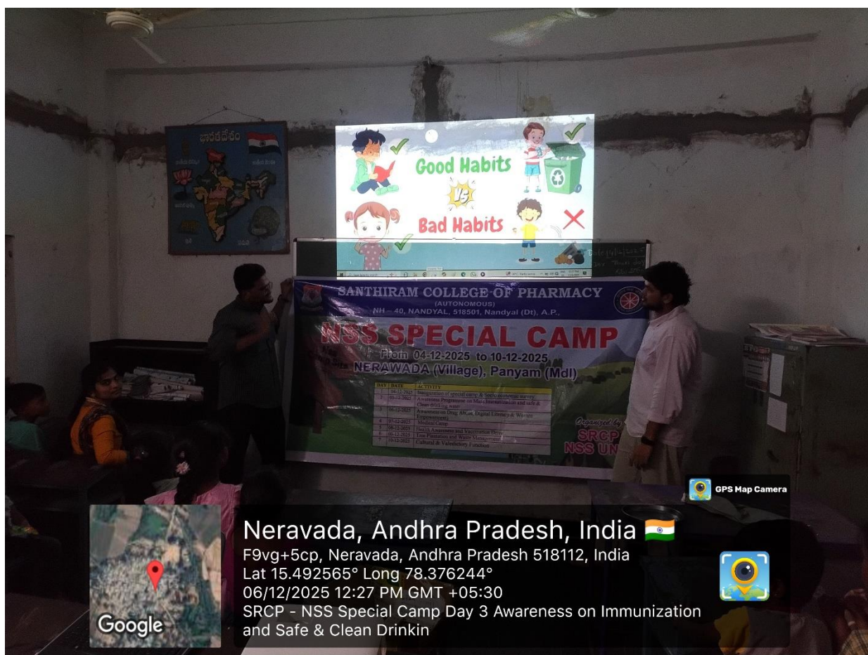
Photo: Awareness by the Students to the School Children's of Nerawada Village

NSS student volunteers conducted interactive awareness sessions focusing on the importance of mass immunization and safe drinking water . To ensure better understanding among school children, the volunteers used PowerPoint presentations and cartoon videos , making the session lively, child-friendly, and informative.