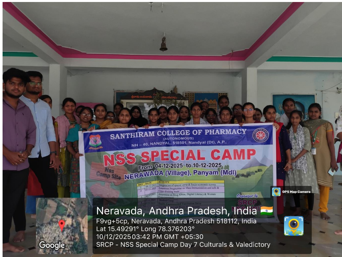
Photos: Closing Photo Cultural & Valedictory Function at Day 7 in Nerawada

The Day 7 Cultural and Valedictory Function organized by the NSS Unit of Santhiram College of Pharmacy at Nerawada Village was a grand success. The programme concluded the NSS Special Camp on a positive note, reinforcing the spirit of service, unity, and social responsibility among students and the community.