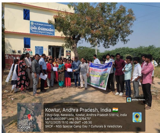
Photos: Cultural & Valedictory Function at Day 7 in Nerawada Village

actively participate in similar social and community-oriented programmes in the future, emphasizing the importance of youth involvement in village development and nation-building.