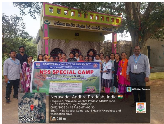
Photos: Health Awareness and Vaccination Drive at Nerawada Village

The Day 5 Health Awareness and Vaccination Drive organized by the NSS Unit of Santhiram College of Pharmacy at Nerawada Village was successful and impactful. The programme contributed significantly to improving health awareness and promoting vaccination, fulfilling the objectives of the NSS Special Camp.