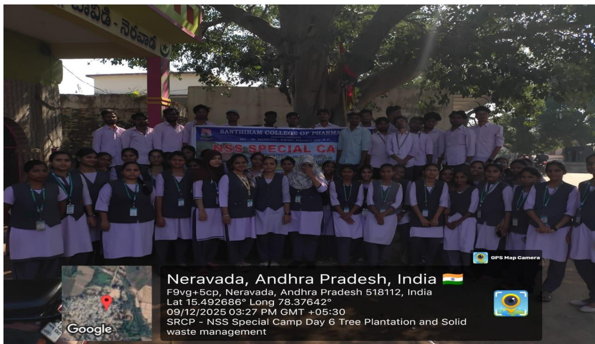
Photos: Tree Plantation & Solid waste management programme in Nerawada Village

The Day 6 Tree Plantation and Waste Management Programme conducted by the NSS Unit of Santhiram College of Pharmacy at Nerawada Village was successful and impactful. The programme instilled environmental responsibility among villagers and volunteers, contributing to a cleaner and greener village.