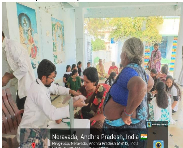
Photos: Medical Camp at Nerawada Village